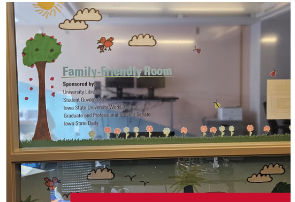
Outside of the Family-Friendly Room