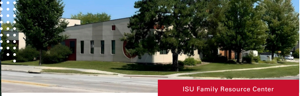
ISU Family Resource Center