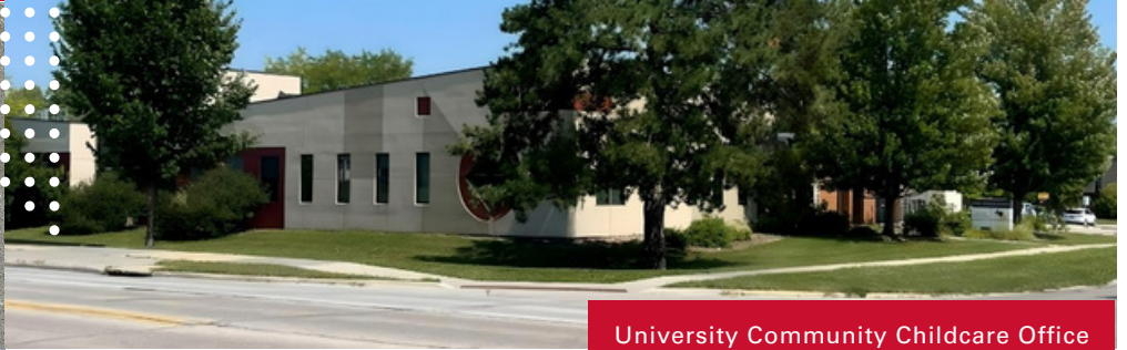
University Community Childcare Office